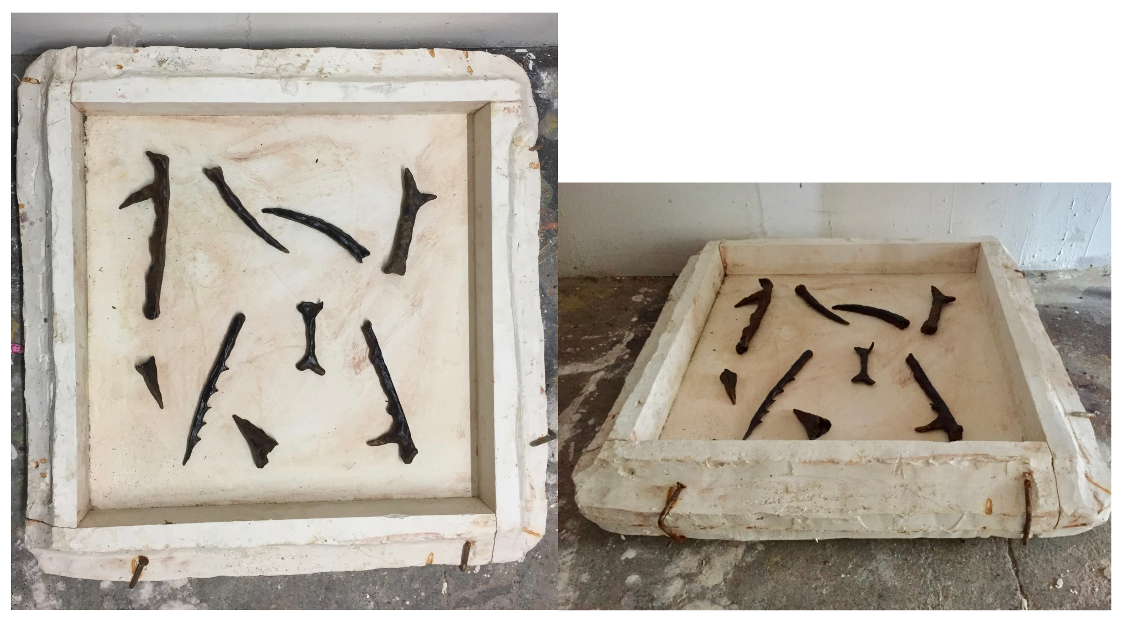
Cursus cerve: bitumen painted porcelain bones on plaster mould 80 x 78 cm